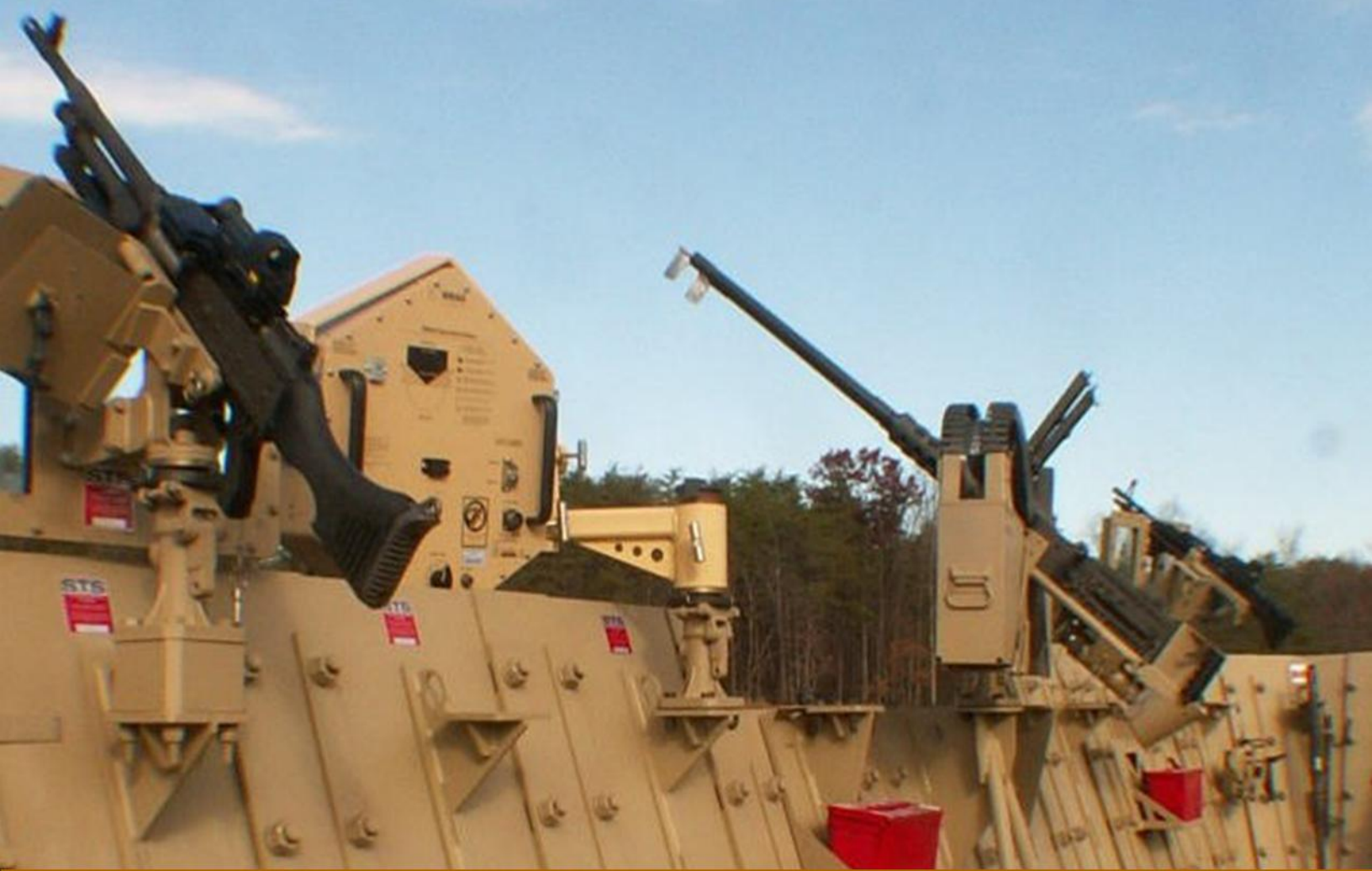
PORTABLE Machine Gun Nests